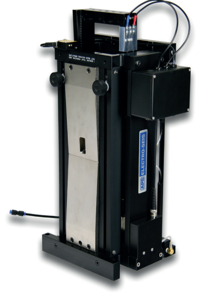
APS 113-AB with APS 0162 vertical mounting kit

APS 0109 - ZERO POSITION CONTROLLER - automatically controls the zero position of a shaker irrespective of its load.