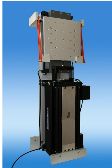
APS 129 with APS 1291 Vertical Mounting Kit

All features of the basic ELECTRO-SEIS® shaker are retained. The drive coil is made for 40 % increase in force with a 50 % duty cycle (30 min cycle).