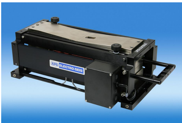
APS 113-AB-LA frontal view

APS 0162 - VERTICAL MOUNTING KIT - permits vertical orientation of the shaker, either free-standing or rigid bench attachment.